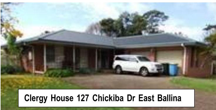
Clergy House 127 Chickiba Dr East Ballina