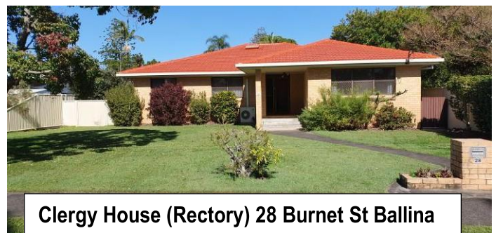
Clergy House (Rectory) 28 Burnet St Ballina