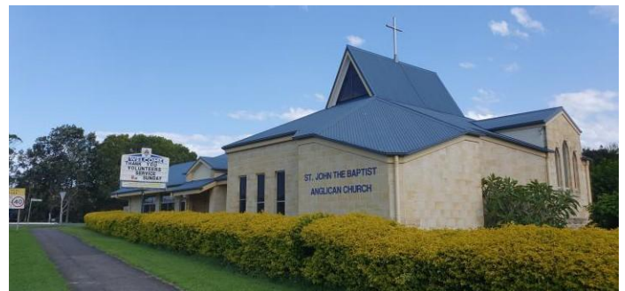
St John the Baptist Church Lennox Head