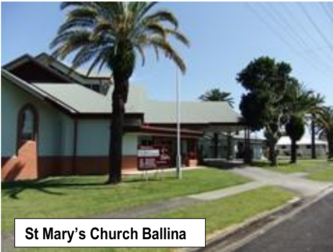
St Mary's Church Ballina