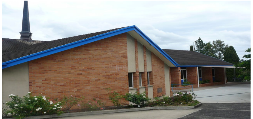
St. James Kyogle

Woodenbong Centre scheduled for closure in 2025