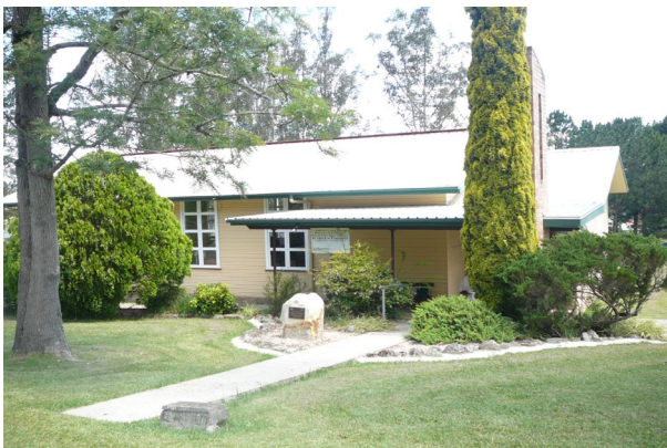
St. Mark's Urbenville