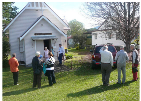
St. Margaret's Woodenbong