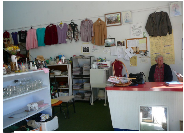
Our Op Shop