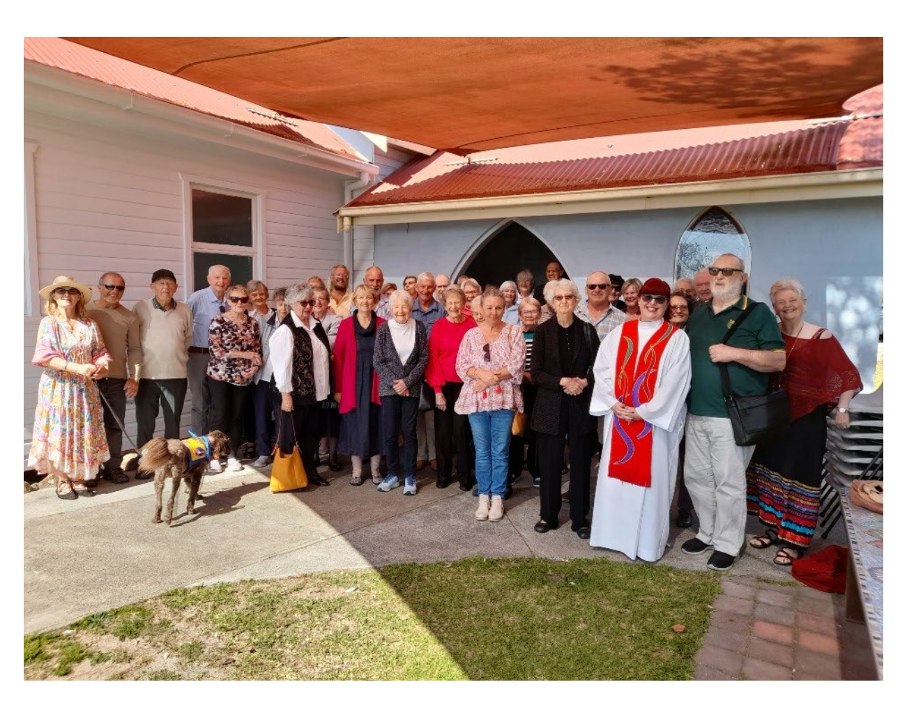
'To Enable All to Experience Life Giving Hope, Love and Faith'