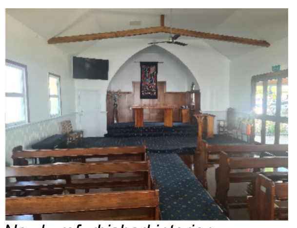
Newly refurbished interior