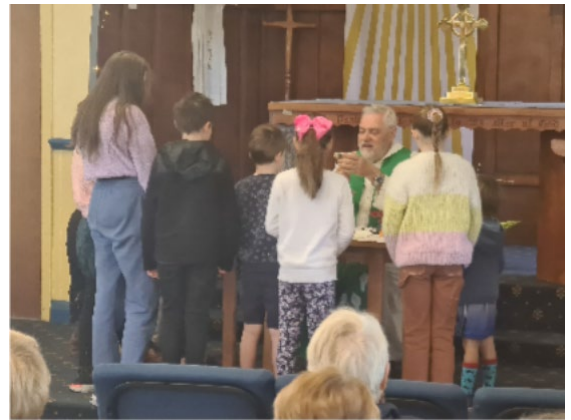
Children's KICK Service, St James Contemporary Worship, St James

Holy Communion Services are held at St Marks on Sunday at 10.30am with electric organ accompaniment. Keyboard is used to accompany worsip, and we are encouraging other instrumentalists to join the team of musicians. Meditation is held weekly on Wednesday afternoon at St James where the new lighting provides more flexibility for meditative and contemporary worship.