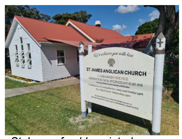
St James freshly painted

The timber Church is located on Marine Parade, close to the CBD of Kingscliff with its busy hotels, restaurants and cafes. Recently a team of parish volunteers has worked tirelessly to improve the site and refurbish the building and grounds. The Church has been painted inside and out, new lighting has been installed and windows, door frames and pews have been polished. The main body of the Church can accommodate a congregation of over sixty-five people, and folding doors open on to a veranda which allows more than a hundred people to be seated at services. The proprietor of a coffee cart leases a part of the Church garden (part of which is set aside as a memorial garden), drawing many people from the community in the pleasant shaded space for coffee, breakfast, and snacks. St James Church hall is hired out to a local Disability Employment Service on Mondays, and hosts a long-running Alcoholics Anonymous meeting on Tuesday evenings.