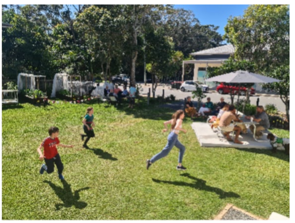
St Marks Picnic Table

Worship is central to our life together. Holy Communion Services are held at St James on Sunday at 8.30am and Wednesday at 10.00am. St James holds a monthly KICK (Kids in Church at Kingscliff) Service at 8.30am on Sunday and a monthly Contemporary Worship Service at 5pm on Sunday.