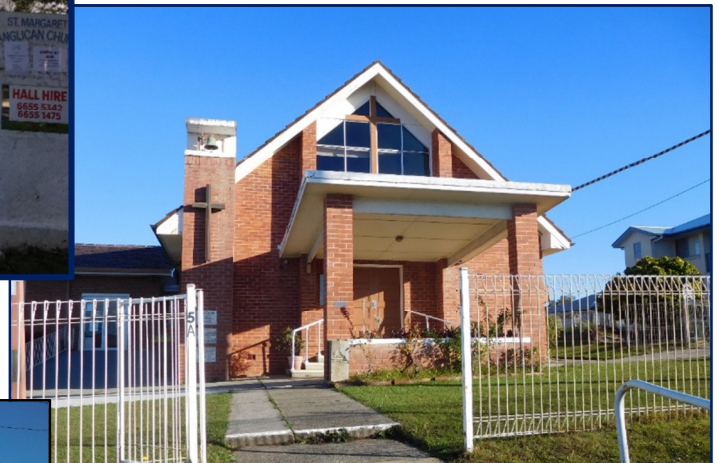
St. Barnabas Urunga