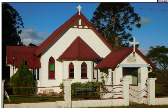
Prince of Peace Raleigh