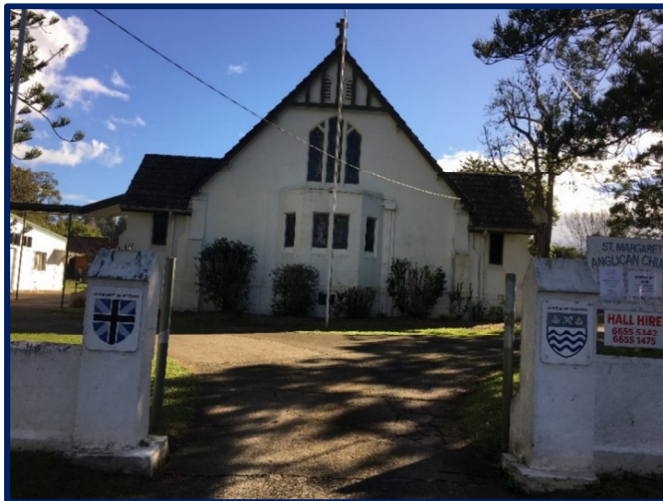
St Margaret's Bellingen

Sharing the good news of Jesus Christ in creative ways throughout our wonderful communities