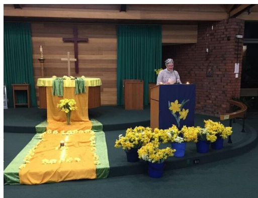
Daffodil Day Service