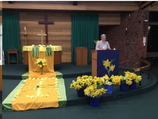
Daffodil Day Service