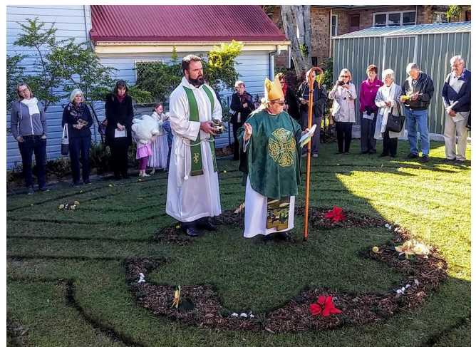
The Labyrinth is situated in the quad area between St. James Church and the Parish Hall.