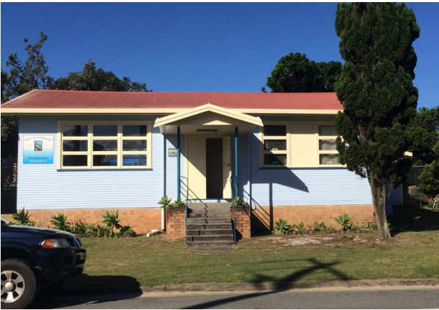
St. James Parish Hall and APOK Ministry Centre and Parish Office 41 Pearl Street Kingscliff, NSW

The Parish Hall is presently being hired out on a regular basis to community groups, such as Art Groups and Alcoholic Anonymous. It is also used for various meetings.