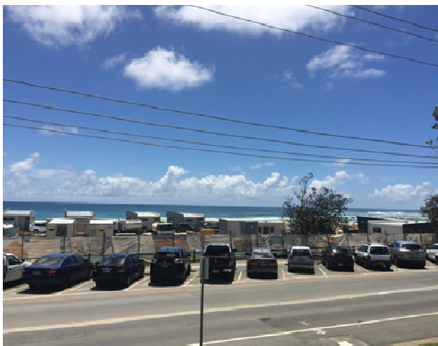
A recent view from the front balcony of the Rectory.