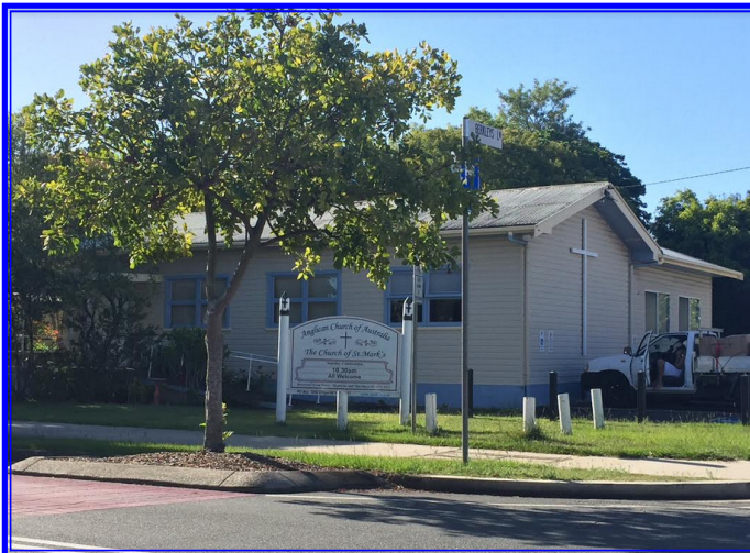
St. Marks 15a Berkley's Lane Pottsville NSW 2489