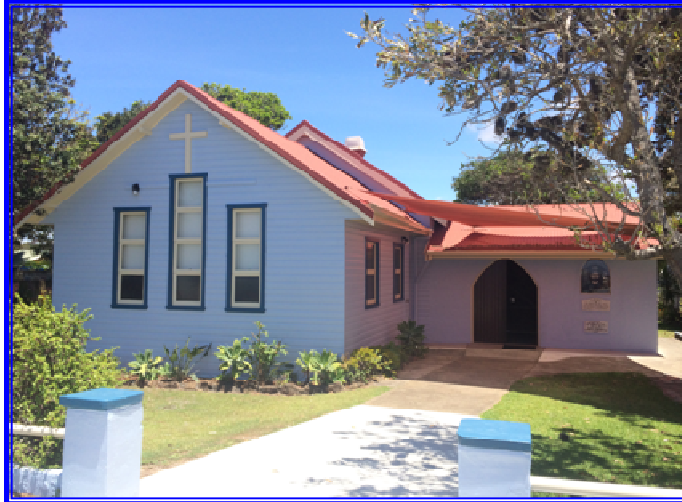
St. James 120 Marine Parade Kingscliff NSW 2487