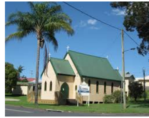
St James at Bowraville